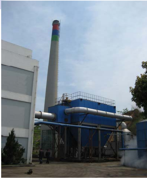
Zhejiang Province, Zhuji, incineration plant