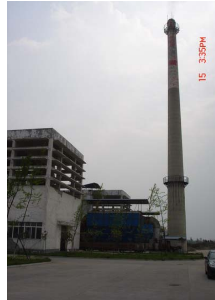
Sichuan Province, Shifang, incineration plant