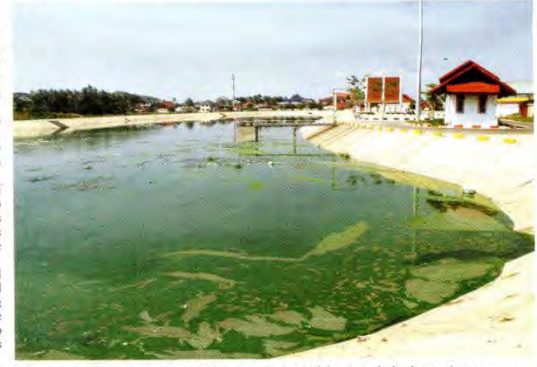
The perhaps not so inviting pond in Sikhottabong Park, which has turned a luminescent green.

When he noticed the smell around him they were huddled and asked