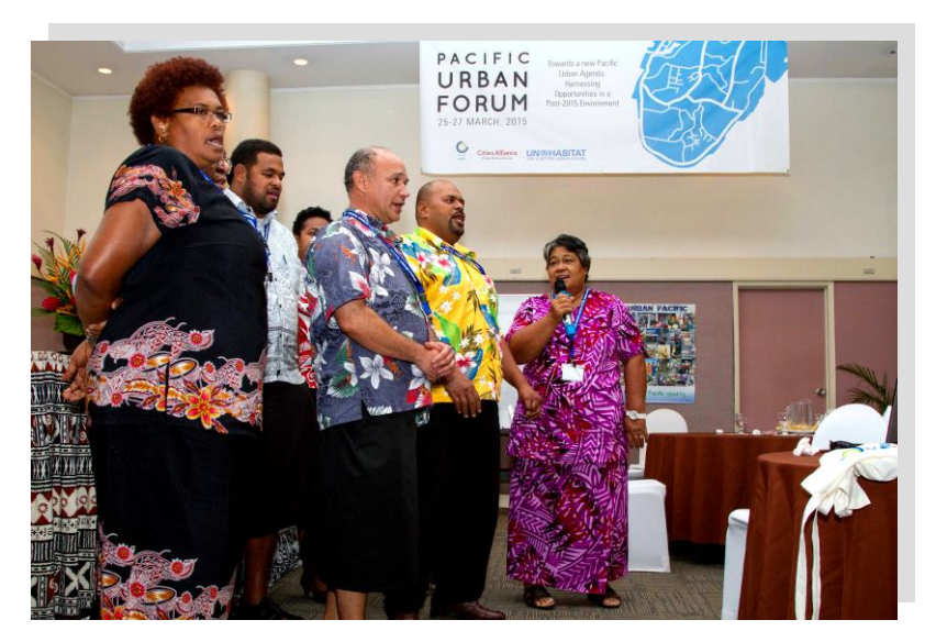
Fijian Delegation during the closing ceremony