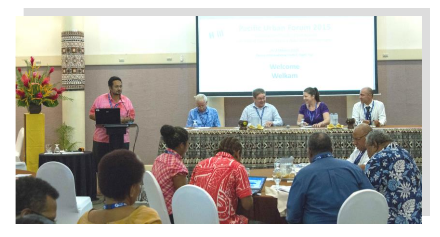
Panelists discussed the Sustainable Development Goals and the post-2015 agenda.

The Pacific Urban Agenda was a part of the previous Pacific Plan, but with 37 priorities, it may not have received the attention it deserved. It was therefore critical to ensure that the New Pacific Urban Agenda be carried forward, possibly independently.