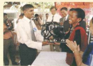
Community Leader making presentation

of the United Nations and Executive Director of UN-HABITAT visited Sri Lanka in October 2005 to review the post tsunami reconstruction programme in Sri Lanka. During her visit to Galle, she had the opportunity of talking to several tsunami affected families and opening a new house and a community bridge. A community leader in her speech thanked UN-HABITAT for allowing the families to organize themselves and take control of the rebuilding process. The Executive Director congratulated the communities for taking the rebuilding process to their own hands and completing over 500 houses in such a short time.