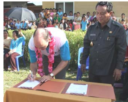
Signing of the hand-over documents