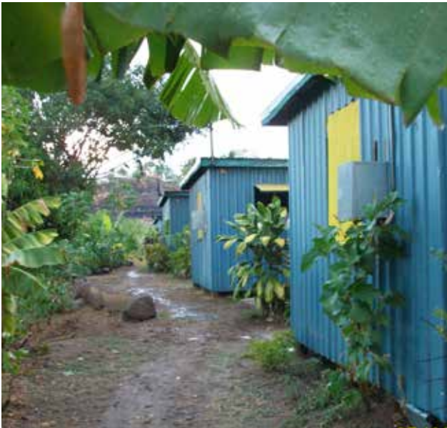
Housing at Koroipita outside Lautoka City