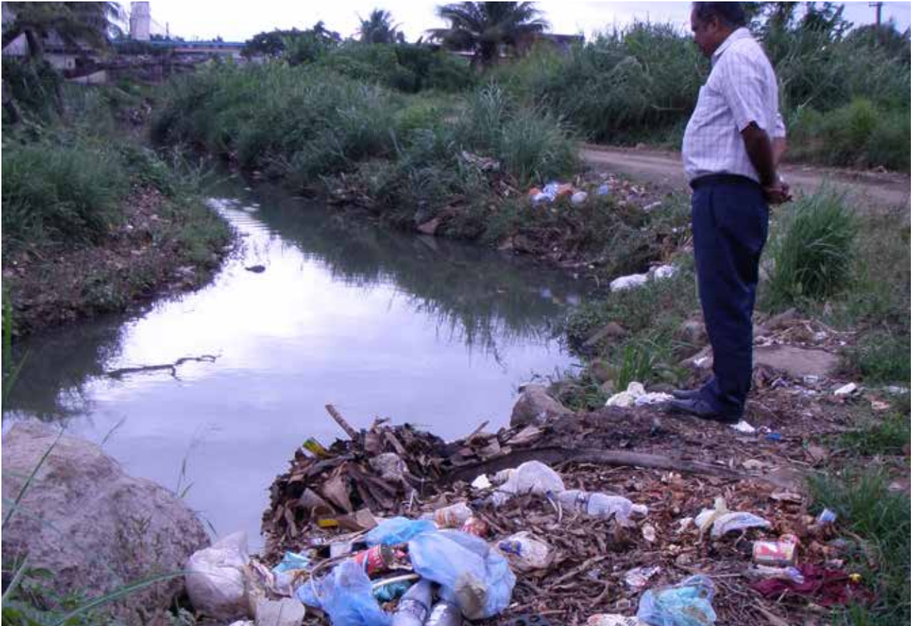
Rubbish dump in Vunato, Lautoka

Rapid Urban Sector Profiling for Sustainability is an action-oriented assessment of urban conditions which focuses on priorities, capacity gaps, and existing institutional responses to key themes at the local and national levels. The purpose of the assessment is to develop urban poverty reduction policies at local, national and regional levels through an assessment of needs and response mechanisms, and as a contribution to the wider-ranging implementation of the Millennium Development Goals.