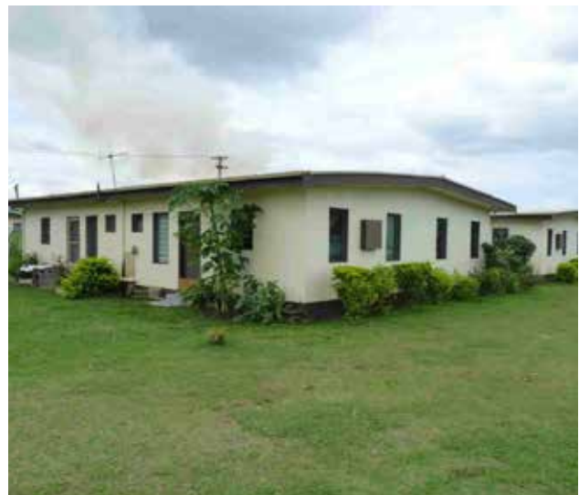
Social housing blocks each containing four homes © SCOPE

Review planning and subdivision standards in order to produce acceptable reduced standards for affordable housing and informal settlement upgrading initiatives.