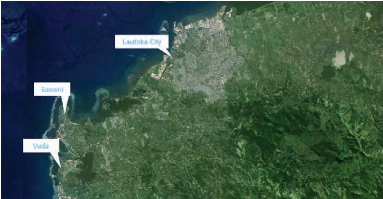
MAP 1: Lautoka City Map