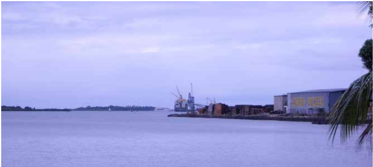
Lautoka Port