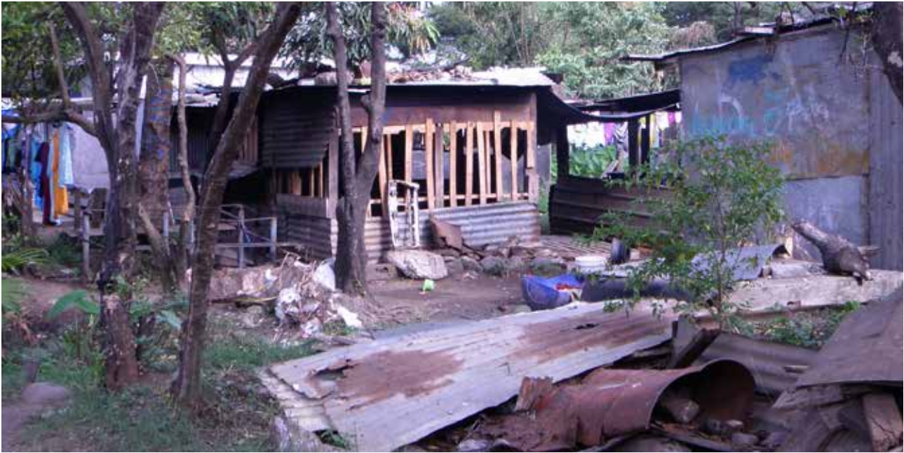
Navutu settlement near the Navutu industrial area