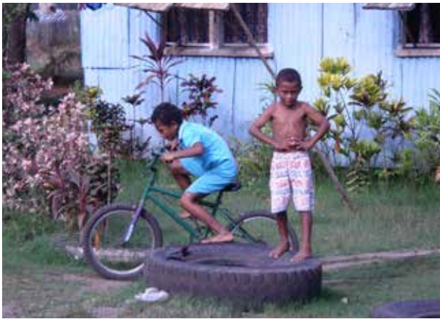
Children play in Navutu settlement

Lautoka City also contains an iTaukei (indigenous Fijian) village, known as Namoli village. While most iTaukei villages are independent of local government, Namoli village is expected to pay rates and comply with Local Government Act regulations because of an earlier subdivision. Despite this, LCC struggles both to enforce development controls in the village, and manage services provided to it. This is because growth and development in Namoli is governed by a traditional village structure.