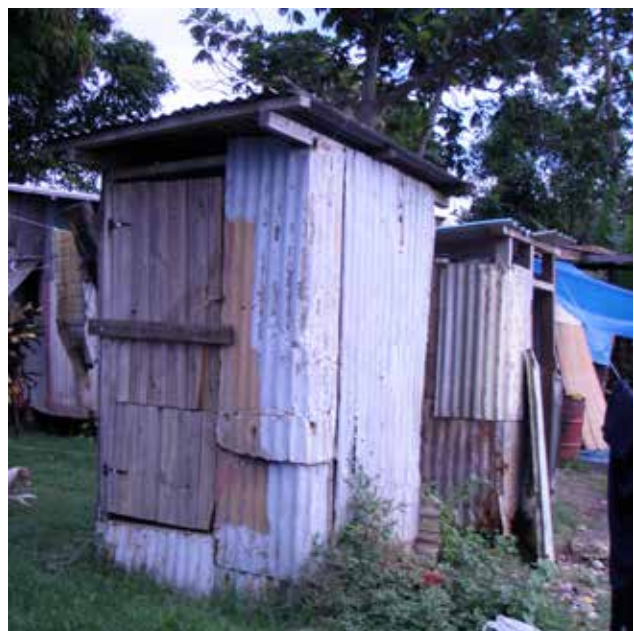
Toilets in Navutu settlement

The informal sector also contributes significantly to the local economy through the supply of labour, small business, micro-enterprise and fresh produce. The informal sector is assisted by the national government as well as the International Labour Organization. Support from these agencies ranges from capacity building initiatives to the establishment of small business ventures and cottage industries. The Integrated Human Resource Development Program of the Ministry of Labour has had a significant impact on the informal sector. In both the urban and peri-urban areas of Lautoka City, this programme has undertaken a broad suite of activities and micro-enterprises including agriculture, pig farming, poultry ventures, bakeries, handicrafts and crop farming for fresh produce.