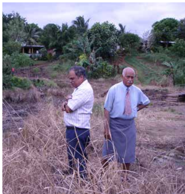
LCC staff carrying out inspections