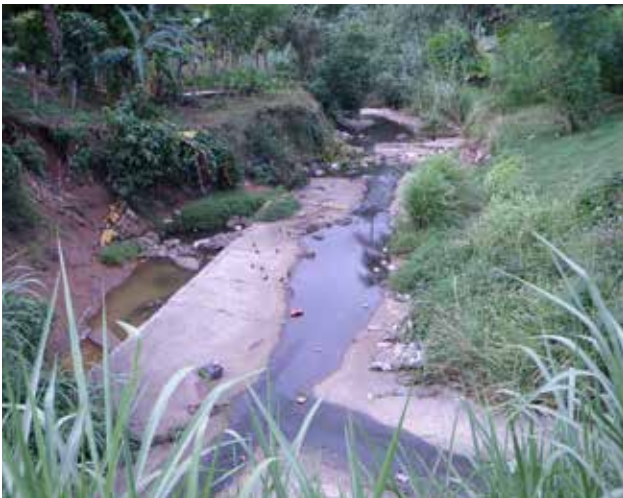
Poor drainage systems