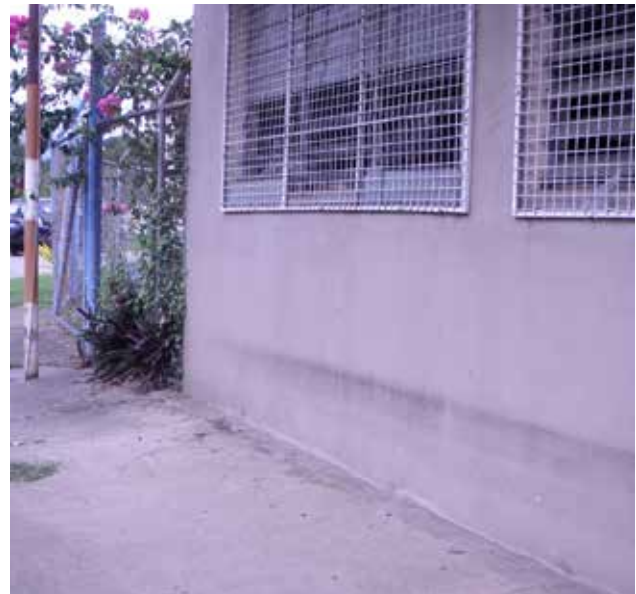
Records of the flood water level in the industrial area of Lautoka City

Community-level awareness raising and capacity building for the disaster management plan.