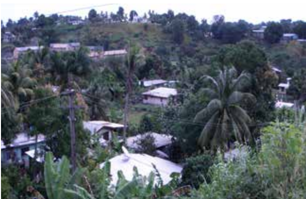
Informal settlements within the boundaries of Lautoka City