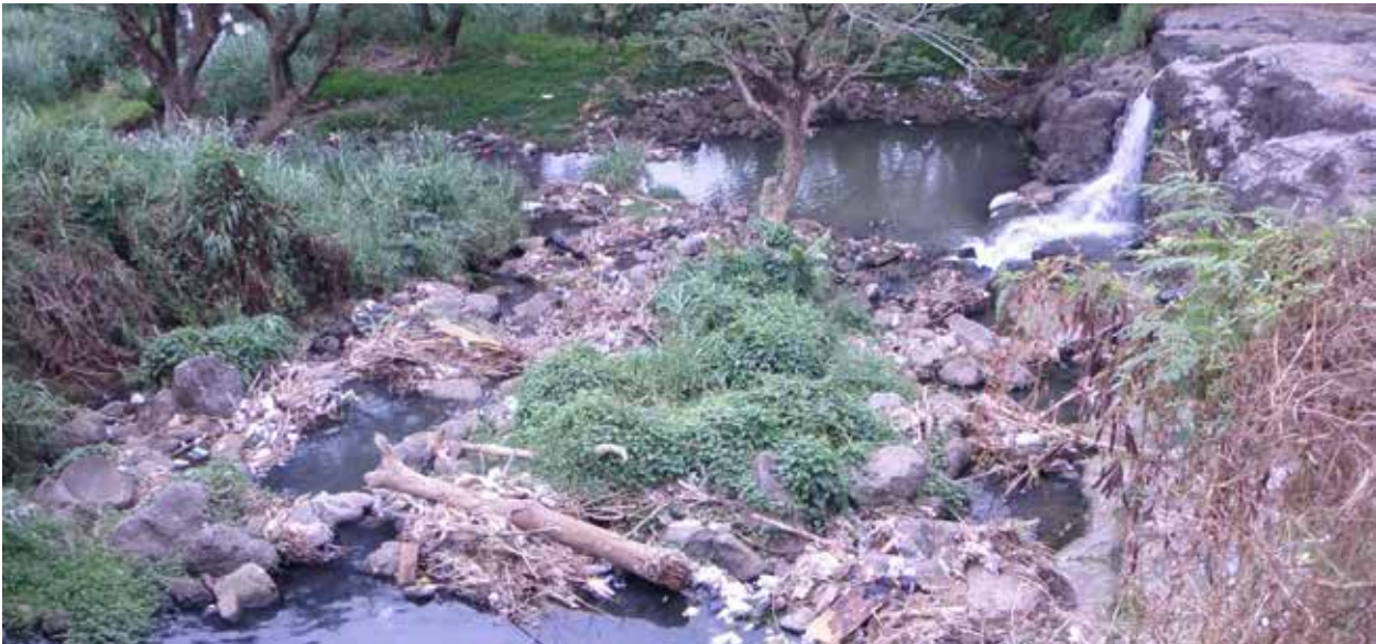
Poor solid waste management can result in the blocking of natural waterways