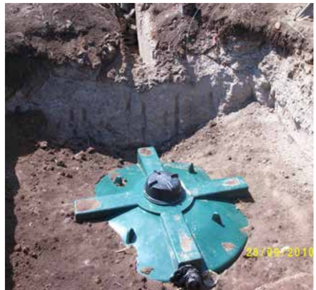
Rotamould tanks used as septic tanks at Koroipita.

Incorporate information into the Greater Western Urban Growth Management Plan.