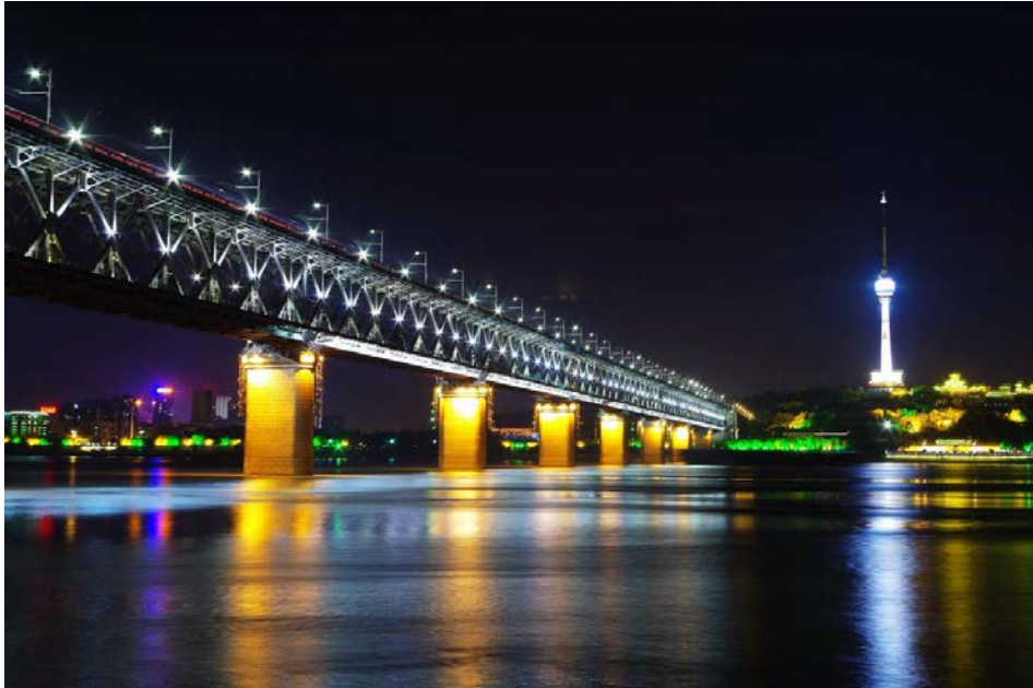
Wuhan Yangtze River Bridge and Guishan Tower

Answer: The unique scenery of buildings and riverside of Yangtze River and Han River attract tourists.